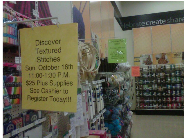
Sara Erickson, CEM at Michaels in Racine, WI, created these three Discover class call out signs and hung them in a 15 foot section of yarn. Work with your store manager or CEM to create signs like these for your store, calling out class name, class day and time, how much and how to sign up!