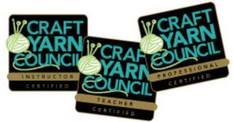
CIP pins graduates receive after completing various levels of the program.