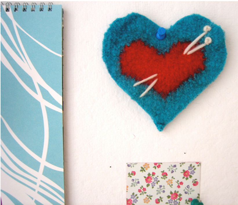
Yarn Pride Felted Badge

I love yarn, but I'll admit: I'm a bit of a yarn snob. I only like to work with all-natural fibers, like wool. I love that wool has so many magical qualities -- it absorbs water and keeps you dry, it's lightweight yet extremely warm -- those sheep know what they're doing! And I especially love that when you sniff a ball of 100% wool yarn, you can smell the sheep in it. Yum.