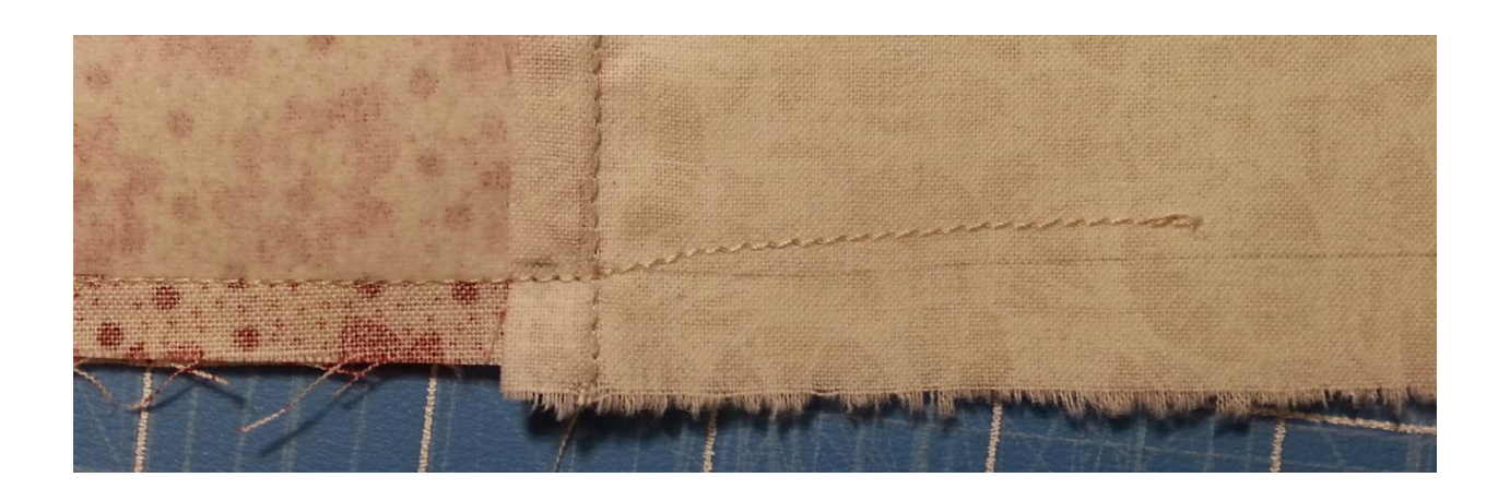
<u>Step 4:</u> When stitching lining, angle stitching line in 1/8" to allow lining to fit smoothly inside body of stocking.

<u>Step 5:</u> Turn right side out. Stitch seam opening in lining closed. Push lining down into body of stocking, adjusting to lay smooth. Fold cuff down, making sure lining stays inside stocking body and lower edge of cuff is smooth and straight. Pin lining to body at the top, turn cuff back up and stitch around top of stocking, just inside the lining area. Do not sew thru cuff. Turn cuff back down. Press stocking.