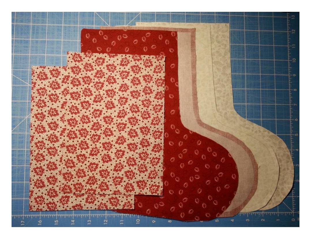
Step 1: Using pattern pieces, cut two cuff pieces, 2 body pieces, and 2 lining pieces, allowing 1/4" seam allowance. Cut fusible interfacing with no seam allowance and fuse to body and cuff.

Step 2: Using the diagram below, sew cuffs and body as shown to lining piece. Make two units.